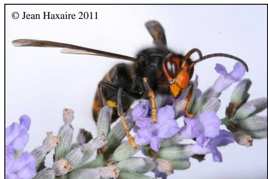
Asian hornet, Vespa velutina nigrithorax

There has been much interest in the Asian Hornet, Vespa velutina in the SE region due to our close proximity to the French coast. I have had several beekeepers who have said that they had seen this hornet but unfortunately no-one has managed to catch an example to prove the identity. I am expecting an incursion of this exotic insect and will be much surprised if it is not confirmed in the coming season.